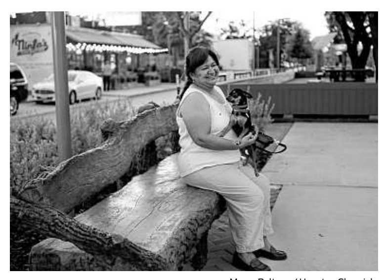
The Esplanade on Navigation in Houston's East End was transformed into an inviting public space.

Some of our biggest commercial districts are a small step away from remaking themselves. Places like City Centre